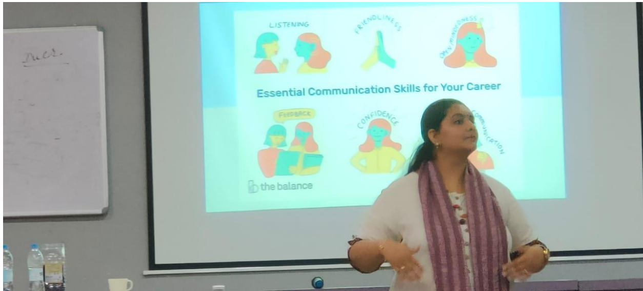
Expert Delivering Session