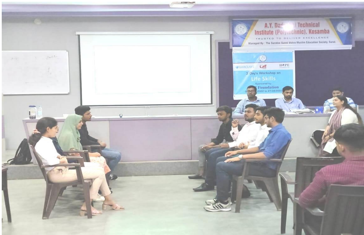
Group Discussion session